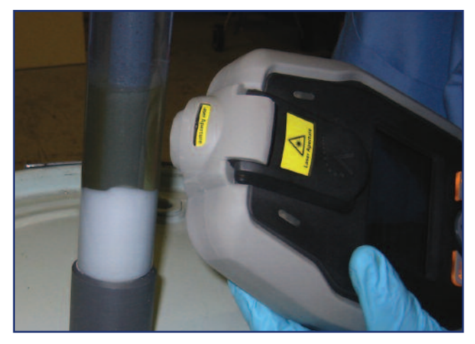
Figure 3: Each layer of the stratified waste contained in a COLIWASA is rapidly identified by Ahura's First Defender unit.