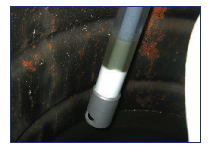
Figure 2: COLIWASAs are used to sample stratified wastes in a container.

The versatility of the First Defender through its accurate non-contact line-of-sight measurements make it ideal for onsite hazardous waste identification in real world environmental conditions.